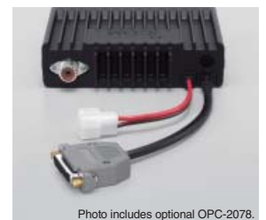
Photo includes optional OPC-2078.

The optional ACC cable allows you to connect with various external devices to control audio output, modulated signal input, remote channel control, horn honk and many more functions. OPC-1939 is a D-SUB 15-pin type and OPC-2078 is a D-SUB 25-pin type.